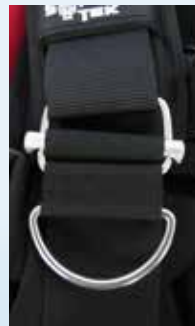
detail of the adjustable shoulder buckle