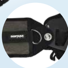
attachment to our small back plate