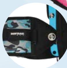
attachment to the back plate