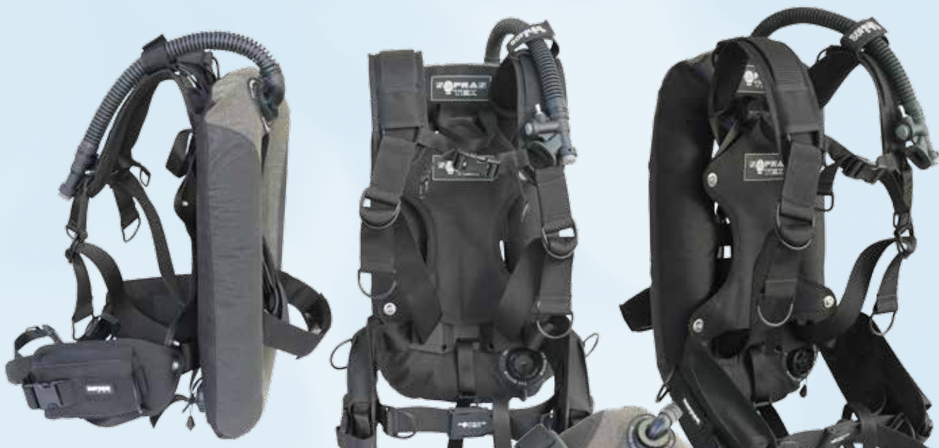
Harness 240170 + Donut (kevlar) 240044 + 240309 (black weight pockets)

Combination of our Harness Ultra Light Hard (using the small black anodized BP 219.97) with the Ultra Light Donut (available in 4 different colours). Very streamlined set up suitable for single tank diving. Pockets can be in the same colour as the donut. The polstering on the plate and shoulder padding ensures maximum comfort. Adjustable harness strap system. The crotch strap in 25mm webbing and coupled with a chest buckle ensure perfect fit. Quick release weight pockets (available in 5 different colours, see page 7) on the waist strap. All the rings and the waist buckle are in black anodized aluminium for minimum weight.