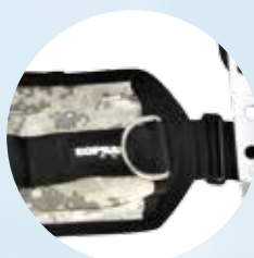
attachment to the waist strap