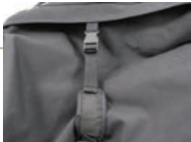
Crotch strap with neoprene protection Double crotch strap at the back