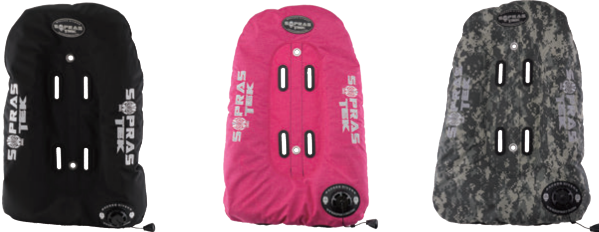
24008B LZ 11 24008P LZ 11 24008G LZ 11

Bladders with 14 litres volume in three different colours