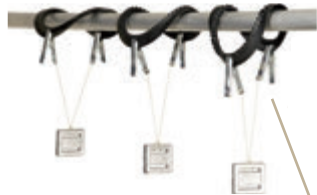
DRUST Neck System, the third generation of Neck System. Even softer and more flexible.