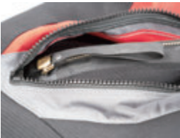
Front BDM waterproof zipper covered with external zipper