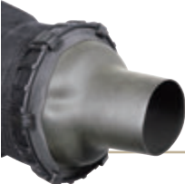
SLÄGGÖ Flex Ring