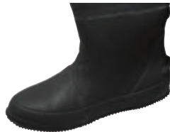
Heavy duty rubber boot