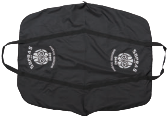
The bag can be used as a mat