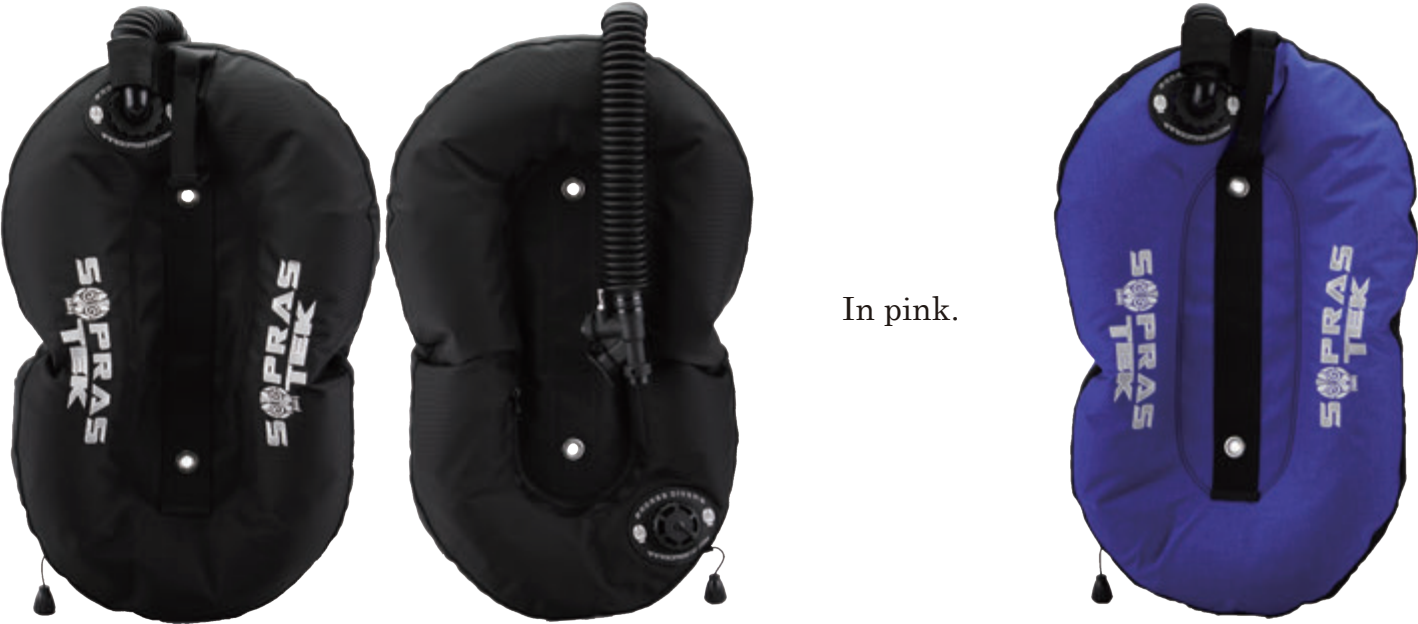
24009K LZ 14(Front/Back) 24009P LZ 14 24009B LZ 14

Bladders with 14 litres volume in three different colours