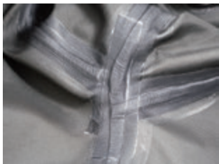
Double taping on the crotch junction on the inside to ensure maximum waterproofness