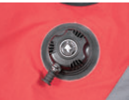
Inflation Valve: SI TECH Shell