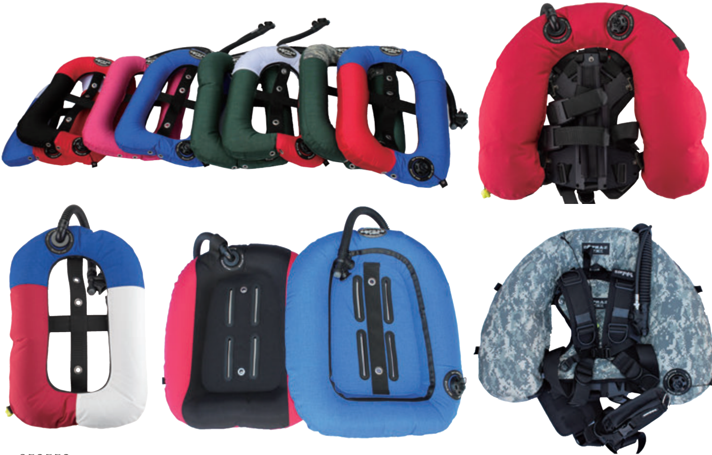
852552 Black 1m SMB