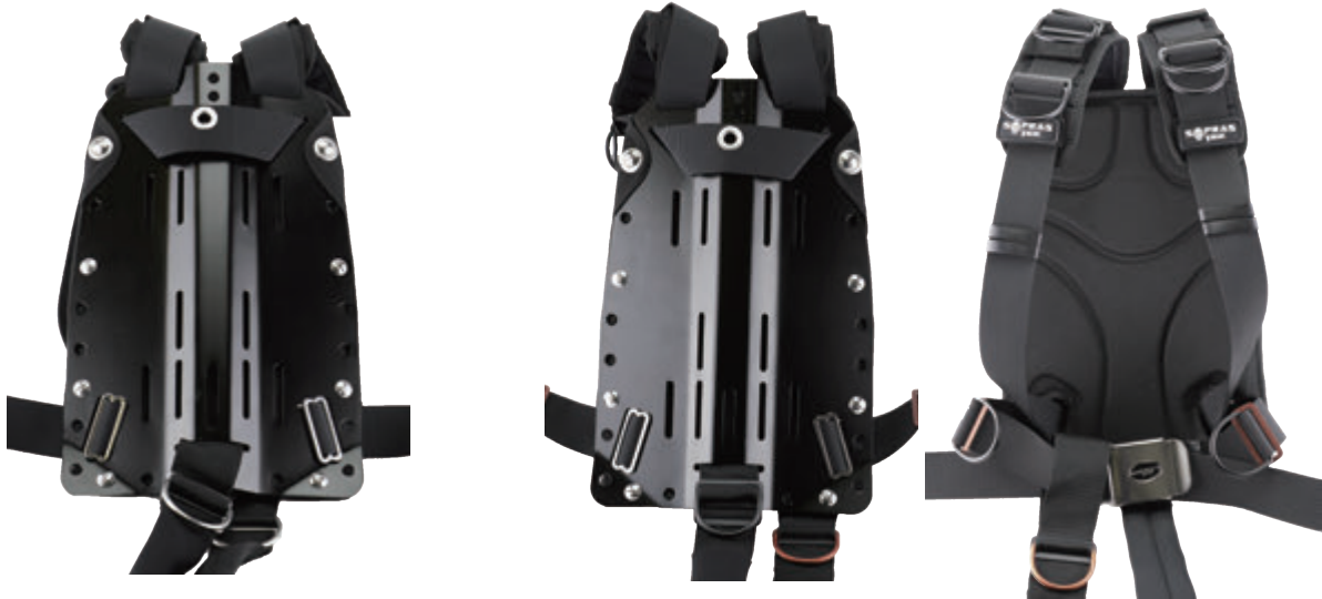
24010S - size L 24011S - size S W/padding on SS plate and shoulders w/SS D-rings.