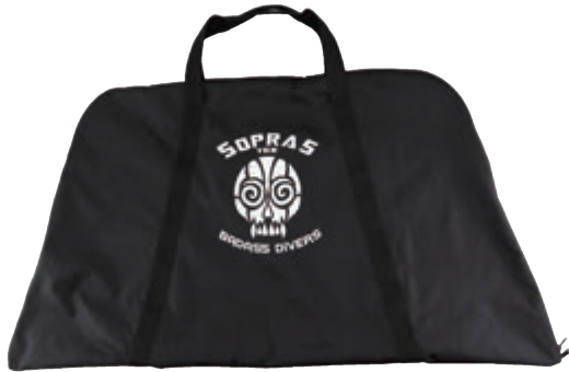
852111 Bag for Dry Suit