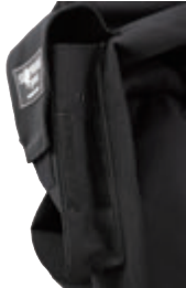
The large pockets can be squeezed if not used